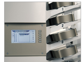
ACF 510 display and fan