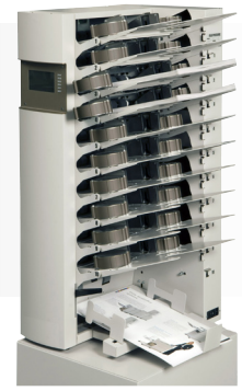
AC 510 with air separation

High capacity user friendly range of feeders & collators for digital and litho printed applications.