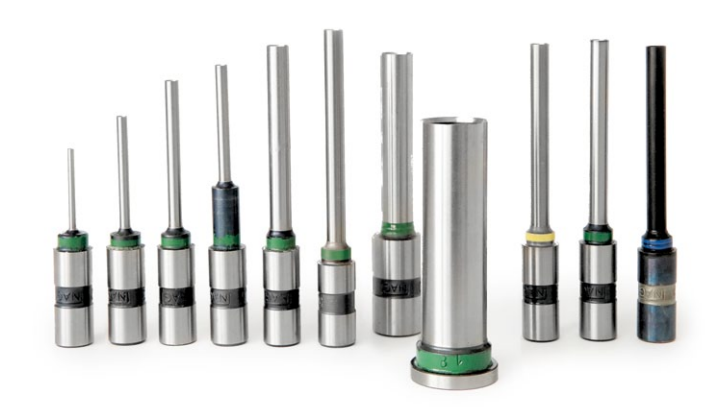
Nagel paper drill bits: 2-35 mm diameter, 30-60 mm working length, and special designs on request