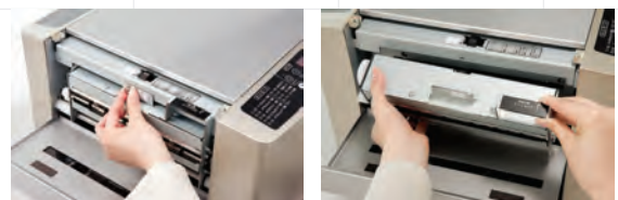
You are able to change the slitter unit by just one knob screw. No tool are required.

The VersaTrim is able to make not only business cards, but also post cards, insertion cards with just standard slitters. Of course the optional perforation unit, scoring unit, photo card unit and more are available. You can change the slitter units rapidly without changing any tools.