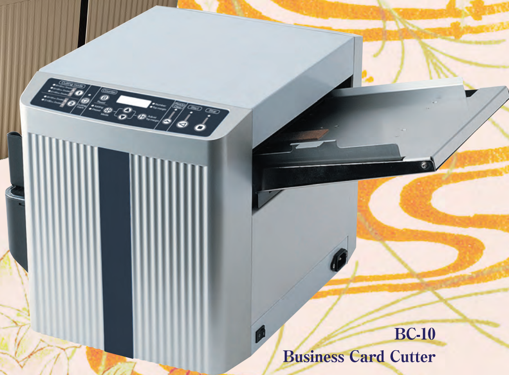
BC-10 Business Card Cutter