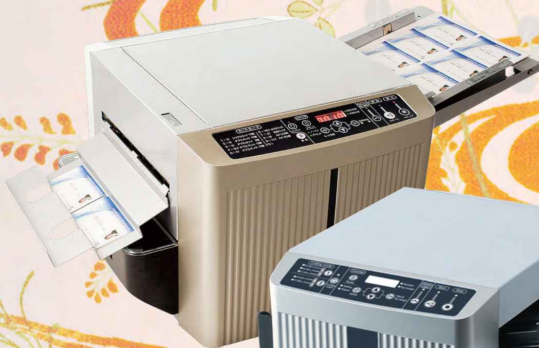
VersaTrim Multi Card Cutter