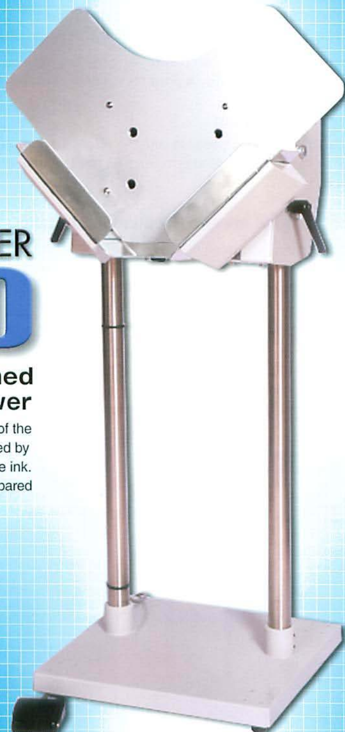
When A3 / Ledger size tray is used.