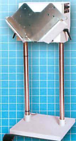
When A4 / Letter size tray is used.

Jogging time is significantly reduced by the effect of the air blower. Wet ink on printed papers is quickly dried by the air, thus preventing staining of the paper by the ink. See the effect and improvement in productivity compared with conventional joggers.