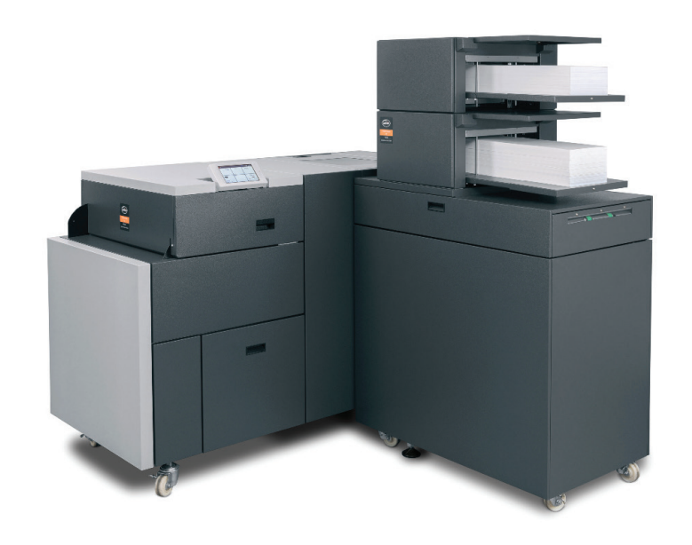
High Quality Stapling Maintenance-free low impact stapler system with extra-high tensile staples and auto adjusting staple pitch.