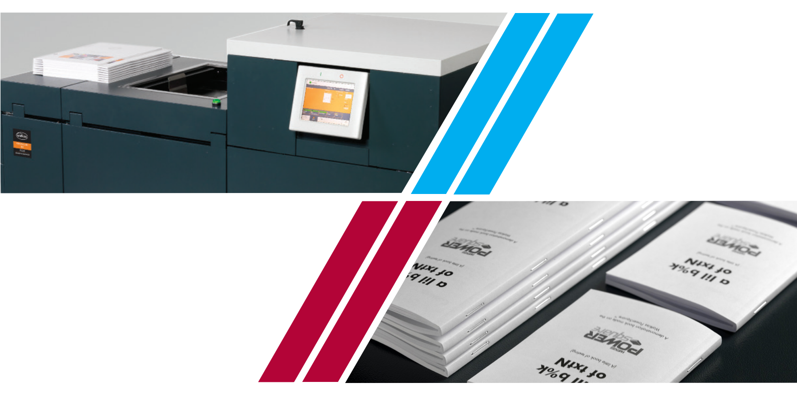
PowerSquare<sup>™</sup> 160 and 224