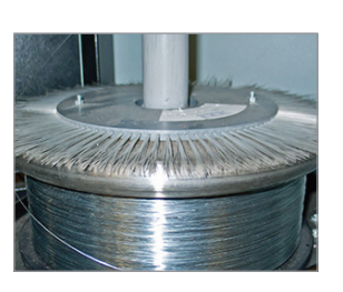
A wire-fed stitch head with fully automatic stitch adjustment ensures perfect stitching quality and low consumable costs.