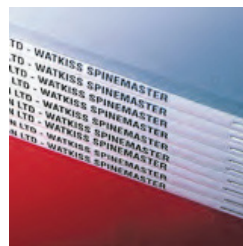
SquareBack booklets can carry print on the spine, just like a perfect bound book.