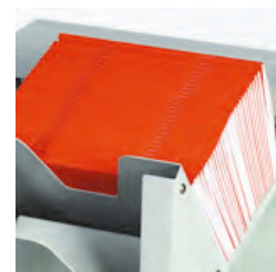
Flat booklets are easy to handle, stack and pack.