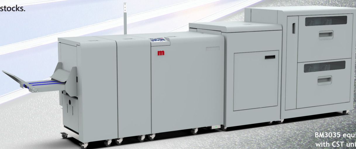
BM3035 equipped with CST unit and VFX Feeder

The optional CST (Crease and side trimmer) unit enables you to produce professional, full bleed trimmed and creased booklets in a cost effective, compact module. Combine this with our unique signature SquareFold system to create a square-back to any document, booklet or publication, giving the effect of a perfect bound book. This finish makes them much easier to handle, stack and pack!