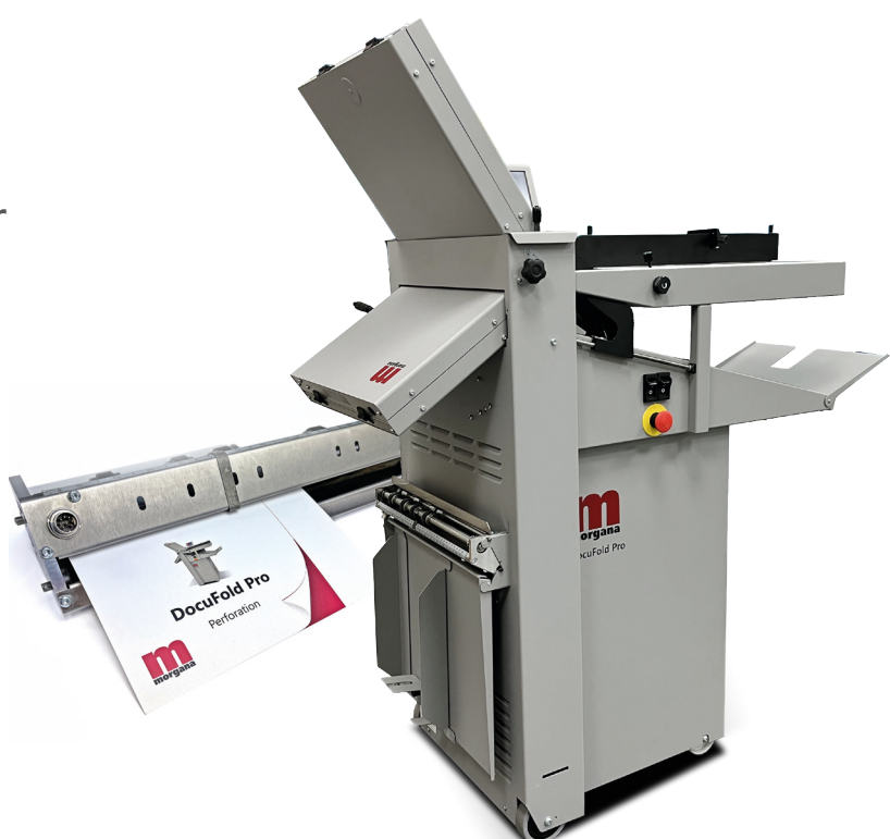
The Scoring/perforating unit can be stored efficiently on the side of the machine when it is not being used.