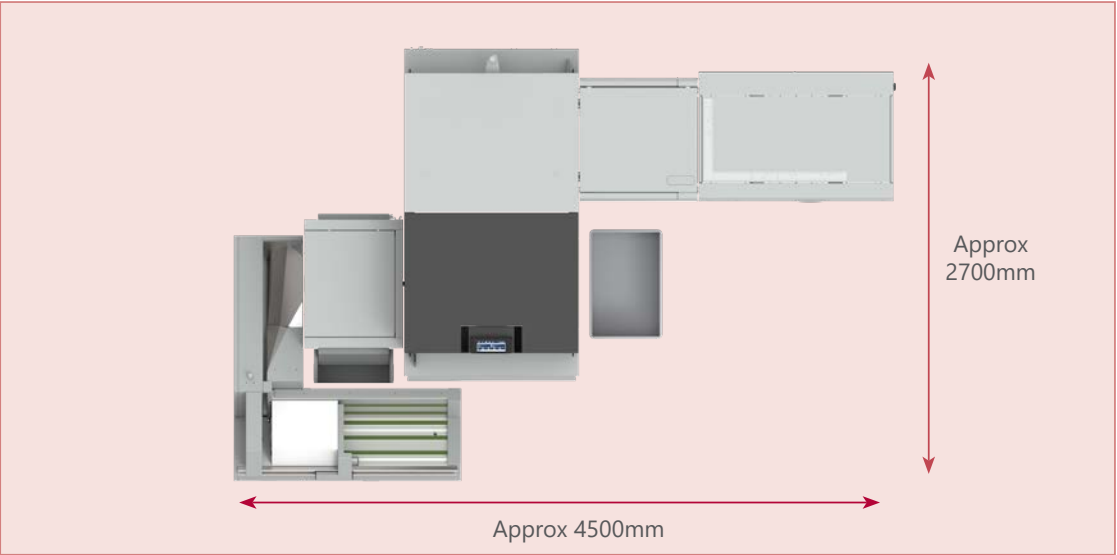
PowerSquare 7000 - Machine dimensions (for illustration purpose only)