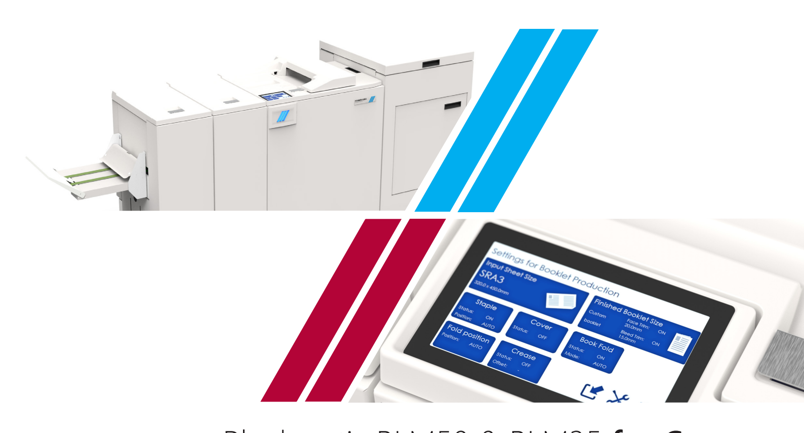
Plockmatic BLM50 & BLM35 for Canon 50 and 35 sheet production booklet makers