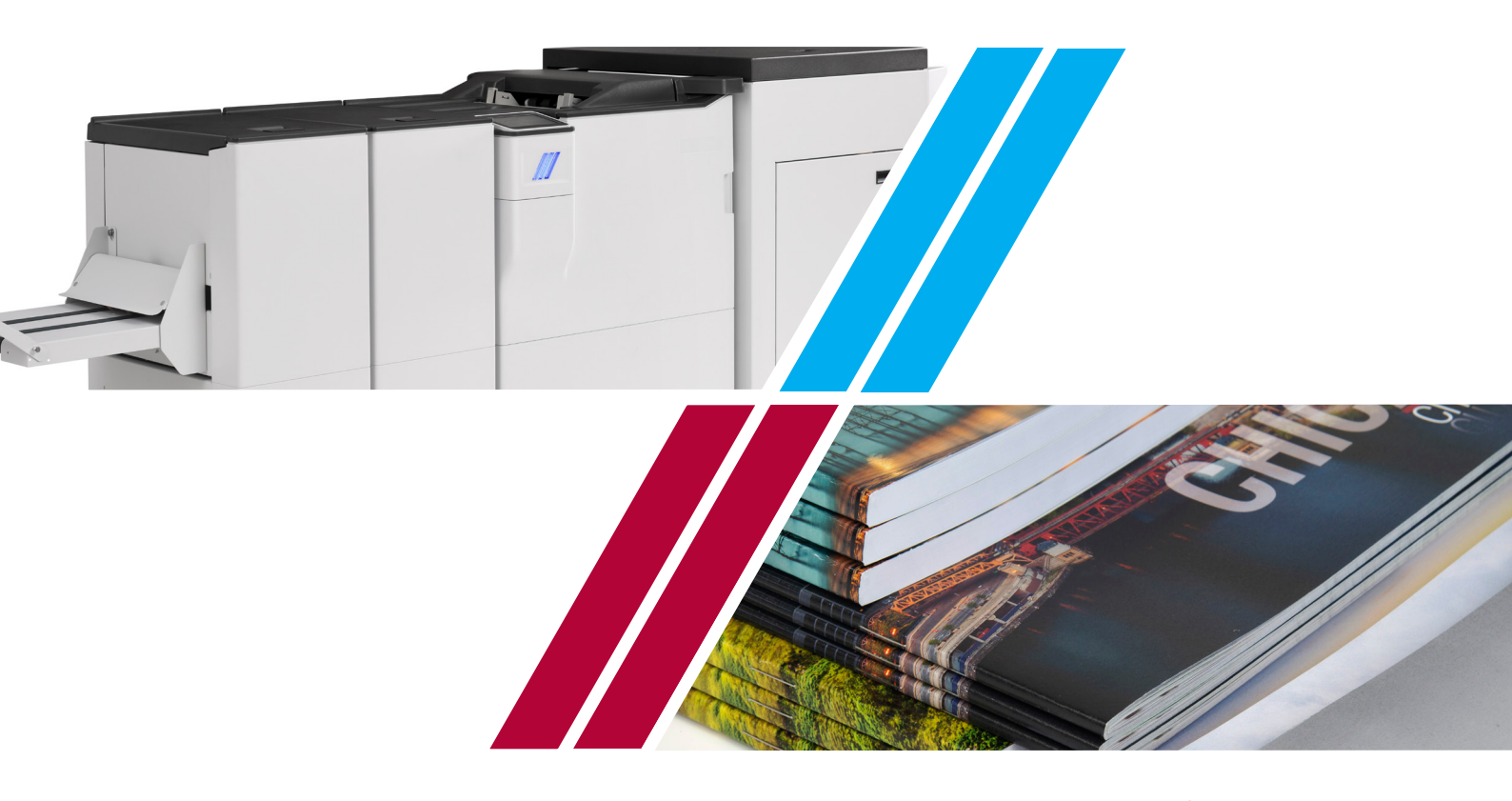
Plockmatic 50/35 sheet family for Ricoh PBM500-m and PBM350-m