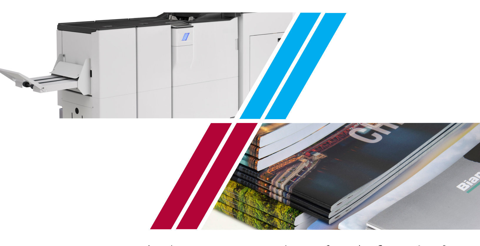
Plockmatic 50/35 sheet family for Ricoh PBM500-m and PBM350-m