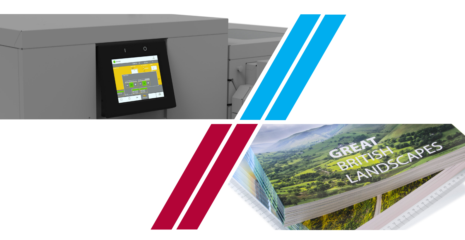
PowerSquare<sup>™</sup> 224 for Ricoh