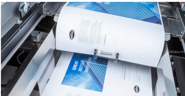
Collating station with the tumbler mechanism prepares the book for stapling and folding

A unique paper transport system with constant position monitoring ensures accurate and consistent paper handling. This ensures optimal sheet management and fold quality from start to finish - important when processing long sheets.