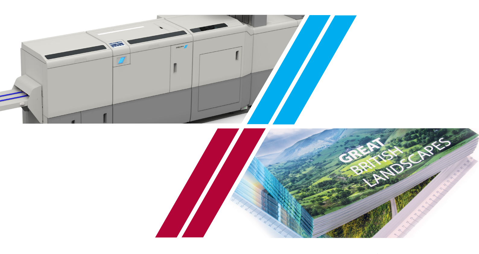
PBM5000 Series for Ricoh