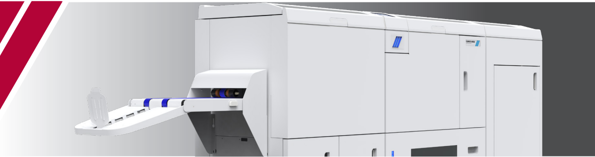
BLM5000 Series for Canon